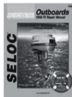
Johnson/Evinrude 1958-1972 50-125 hp 3 cyl, V4 Part#1306 SelocOnLine