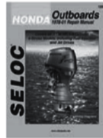
Honda 1978-2001 2.0-130 hp, 1 - 4 cyl Includes Jet Drives Part#1200 SelocOnLine