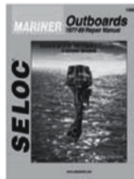
Mariner 1977-1989 2-60 hp 1 - 2 cyl Part#1400