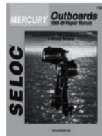
Mercury 1965-1989 2-40 hp 1 - 2 cyl Part#1404 SelocOnLine