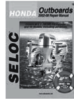
Honda 2002-2008 2.0-225 hp 1 - 4 cyl & V6, Including Jet Drives Part#1202 SelocOnLine