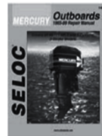
Mercury 1965-1989 40-115 hp 3 - 4 cyl Part#1406 SelocOnLine