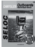
Chrysler 1962-1984 3.5-150 hp, 1 - 4 cyl Part#1000 SelocOnLine