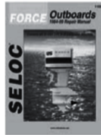
Force 1984-1999 3-150 hp, 1 - 5 cyl Part#1100 SelocOnLine