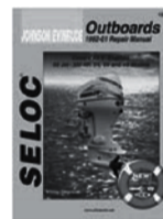
Johnson/Evinrude 1992-2001 65-300 hp V4, V6, V8 Includes Jet Drives Part#1311 SelocOnLine