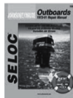
Johnson/Evinrude 1973-1991 60-235 hp 3 cyl, V4, V6 Part#1308 SelocOnLine