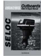
Johnson/Evinrude 1956-1970 1.5-40 hp 1 - 2 cyl Part#1300