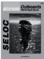
Mercury/Mariner 1990-2000 2.5-275 hp All 2 Stroke Includes Jet Drives Part#1416 SelocOnLine