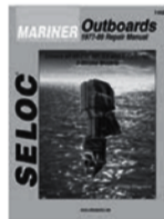
Mariner 1977-1989 45-220 hp 3 - 6 cyl Part#1402