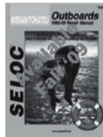
Nissan 1992-2009 2.5-140 hp All Engines Includes Jet Drives Part#1500 SelocOnLine