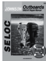
Johnson 2002-2007 3.5-250 hp All Engines Part#1314 SelocOnLine