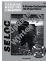
Mercury/Mariner 1995-2004 2.5-225 hp All 4 Stroke Includes Jet Drives Part#1705 SelocOnLine