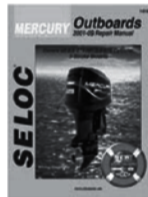
Mercury 2001-2009 2.5-250 hp All 2 Stroke Includes Jet Drives Part#1418 SelocOnLine