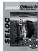
Johnson/Evinrude 1990-2001 1.25-70 hp 2 & 4 Stroke In Line Engines Part#1312 SelocOnLine