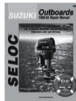
Suzuki 1988-2003 2-225 hp All 2 Stroke Includes Jet Drives Part#1600 SelocOnLine