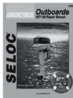
Johnson/Evinrude 1971-1989 1.25-60 hp 1 - 2 cyl Part#1302 SelocOnLine