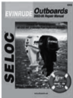
Evinrude 2002-2006 40-250 hp Fuel Injected Engines Part#1313 SelocOnLine