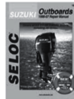
Suzuki 1996-2007 2.5-300 hp All 4 Stroke Includes Jet Drives Part#1602 SelocOnLine