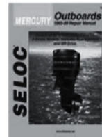
Mercury 1965-1989 90-300 hp 6 cyl Part#1408 SelocOnLine