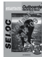
Tohatsu 1992-2009 2.5-140 hp All Engines Includes Jet Drives Part#1500 SelocOnLine